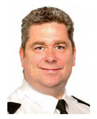
Phil Loach Chief Fire Officer West Midlands Fire Service

The communities that shape and pay for the services we provide, quite rightly require assurance that West Midlands Fire and Rescue Authority continues to do the right things in the right way. The Statement of Assurance provides evidence of structures, systems, processes and evaluation in place to provide the community with the confidence that we continue to deliver excellent prevention, protection and response services, supported by compact back office services in a well governed, legally compliant and value for money way.